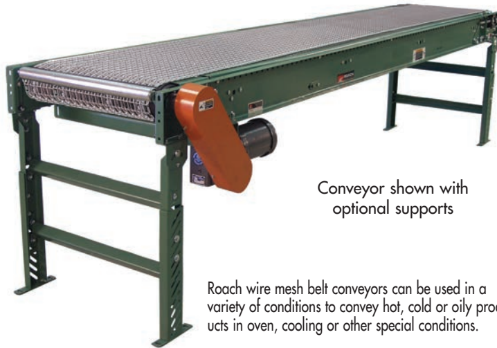
Conveyor shown with optional supports

Roach wire mesh belt conveyors can be used in a variety of conditions to convey hot, cold or oily products in oven, cooling or other special conditions.