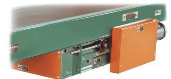
OPTIONAL CENTER DRIVE

ELECTRICAL CONTROLS: Magnetic starter (one direction or reversible); One direction manual starter; Momentary start/stop push button station; Forward/reversing /stop push button station. Mounting and pre-wiring for units up to 12' long.