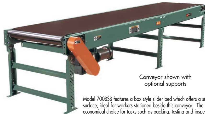
Conveyor shown with optional supports

24 HOUR SHIPMENTS INCLUDE ALL 1-FOOT INCREMENTS 5'-0" TO 100'-0"