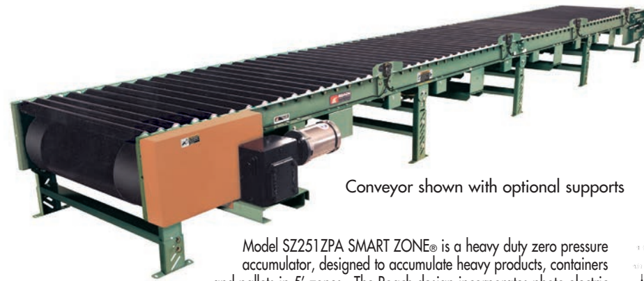
Conveyor shown with optional supports

Model SZ251ZPA SMART ZONE® is a heavy duty zero pressure accumulator, designed to accumulate heavy products, containers and pallets in 5' zones. The Roach design incorporates photo electric sensors instead of sensor rollers, eliminating many common problems associated with conveying wooden pallets. Products do not touch during accumulation and are singulated individually off of conveyor. Heavy loads weighing up to 3000 lbs. may be safely accumulated with Roach SMART ZONE®.