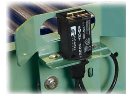
PHOTO SENSOR MOUNT

DEFUSED SMARTZONE: Photoeyes mounted below tread rollers.