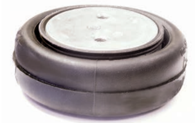
HEAVY DUTY AIR BAG