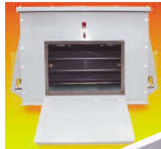
Series ECTR Conveyors have access hatches located at every critical inspection point, allowing easier inspection, maintenance and repair.