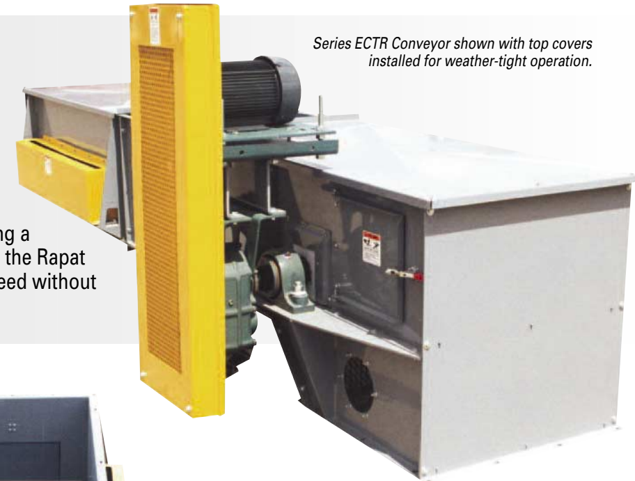
Series ECTR Conveyor shown with top covers installed for weather-tight operation.

Different installations have different requirements. Maybe you would like to keep the wind and weather away from your product, and require enclosure on the sides and top only? Our ECTR Conveyor will suit you perfectly! Or perhaps your installation is in a dust-sensitive area, and you need to keep potentially hazardous dust to a minimum— requiring a fully enclosed and sealed conveyor. In this instance the Rapat ECTR conveyor will provide the containment you need without sacrificing durability or performance.