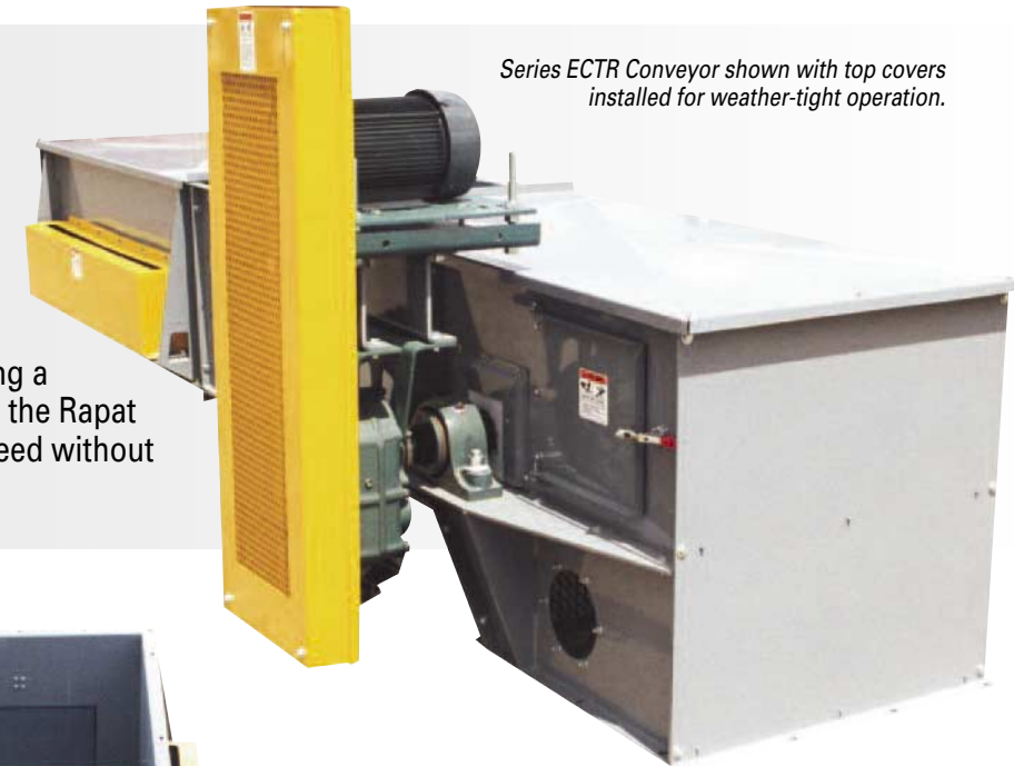
Series ECTR Conveyor shown with top covers installed for weather-tight operation.

Different installations have different requirements. Maybe you would like to keep the wind and weather away from your product, and require enclosure on the sides and top only? Our ECTR Conveyor will suit you perfectly! Or perhaps your installation is in a dust-sensitive area, and you need to keep potentially hazardous dust to a minimum— requiring a fully enclosed and sealed conveyor. In this instance the Rapat ECTR conveyor will provide the containment you need without sacrificing durability or performance.