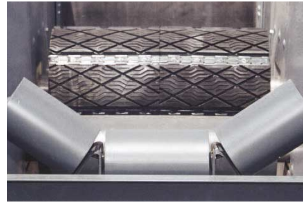
Above: CEMA standard 3-Roll Troughing idlers carry the load. Left: Snap-on cover attachment system means quick, easy enclosure access!