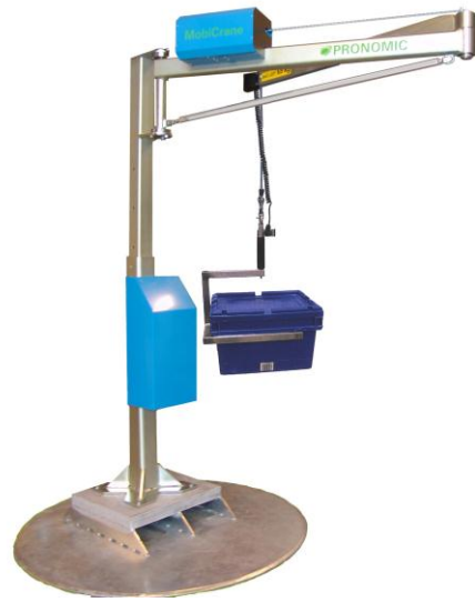
MOBI-Crane™ Series M 24V DC or 110V AC

Material handling for production, warehouse and shipping operations using either standard or custom designed attachments. Typical products handled are doors, windows, pails, bags, totes, CPU's and monitors.