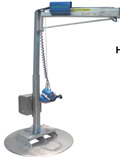
MOBI-Crane II™ Series PV 24V DC or 110V AC