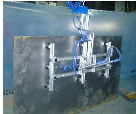
Sheet Steel Handling