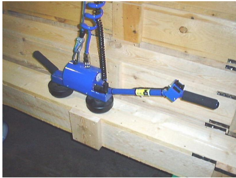
Wooden Crate Pickup