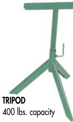
TRIPOD 400 lbs. capacity

Tripod supports are the choice for fast set-up or temporary installations. Easily adjustable, tripods are designed for wheel conveyors and 138 gravity series roller conveyors. Tripods are simply placed underneath conveyor section crossbrace as shown in detail at right.