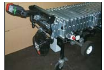
Power Assist Unit