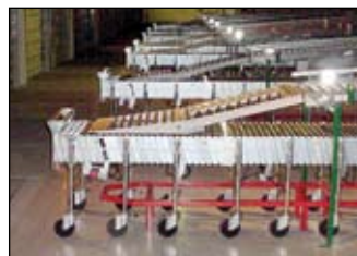
Power Truck Loader with Guide Track and Herringbone transition