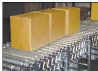
Zero Pressure Accumulation