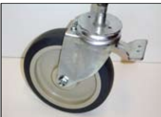
376FL- Fixed Leg