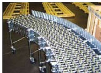
Flexible Side Rails