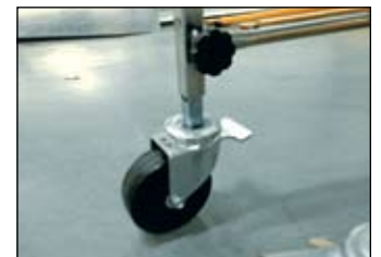
376AL- Adjustable Leg