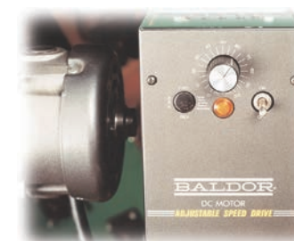
OPTIONAL DC VARIABLE SPEED CONTROLLER

ELECTRICAL CONTROLS: Magnetic starter (one direction or reversible); One direction manual starter; Momentary start/stop push button station; Forward/reversing /stop push button station. Mounting and pre-wiring for units up to 12' long.