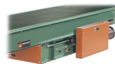
OPTIONAL CENTER DRIVE