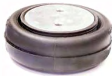
HEAVY DUTY AIR BAG