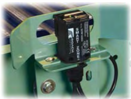
PHOTO SENSOR MOUNT