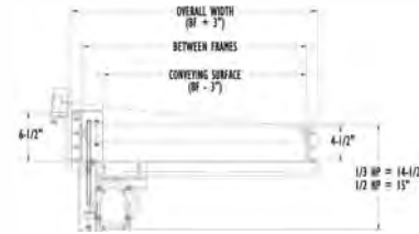
SZD192CDA UNDERNEATH DRIVE