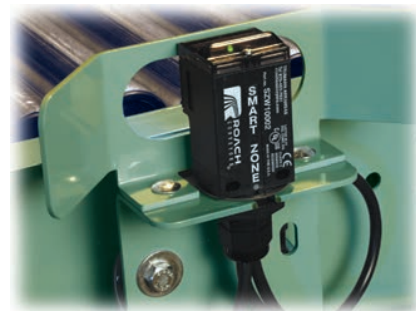
PHOTO SENSOR MOUNT

DEFUSED SMARTZONE: Photoeyes mounted below tread rollers.