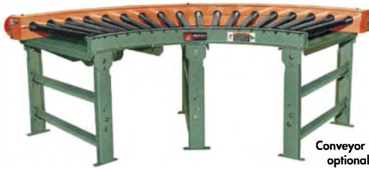
Conveyor shown with optional supports

SPECIFY MODEL NUMBER PER EXAMPLE 192CDLRC-27-45-L 192CDLRC-(between frames)-(degree)-(left or right)