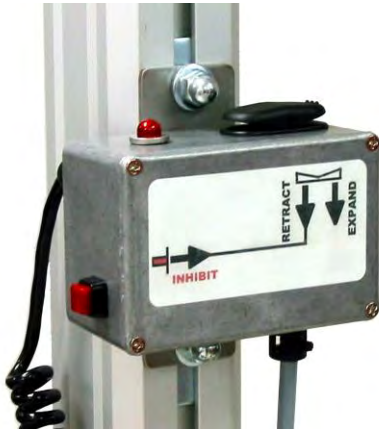
Expand-O-Turn™ Control Module