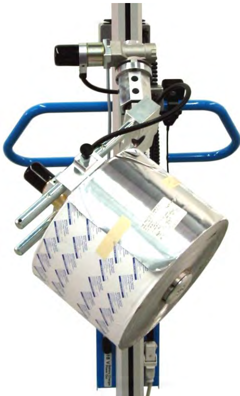
Electric Rotate Assembly