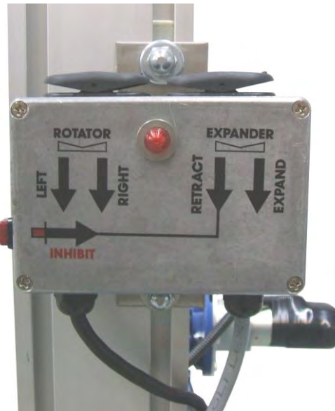
Expand-O-Turn™ Control Module with Optional Electric Rotate