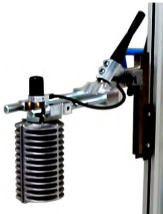
6" Electric Expand-O-Turn

The 12107-1 Series Electric Expand-O-Turn® is an electrically operated core expander for paper and film rolls with 3" and 6" cores and allows for manually rotating the roll. Rolls of varying dimensions, weights up to 300-lbs (depending on roll size), can be picked up from the vertical position at floor/pallet level and deposited at random heights in a horizontal position.