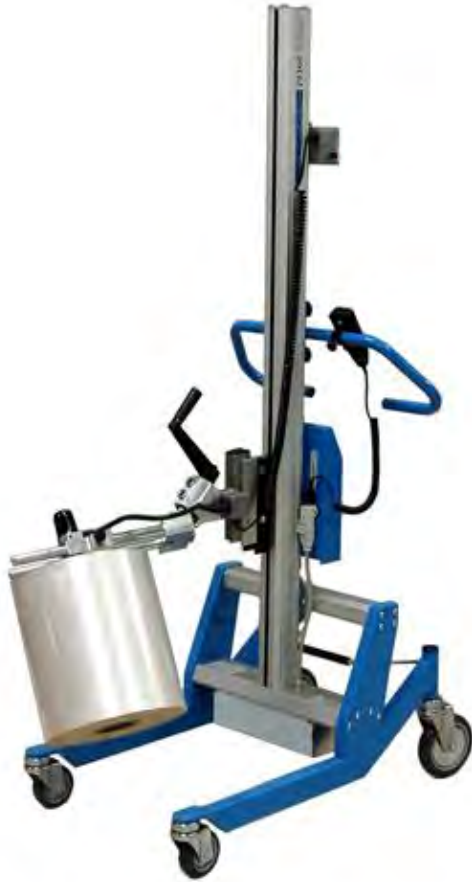
3" Electric Expand-O-Turn™