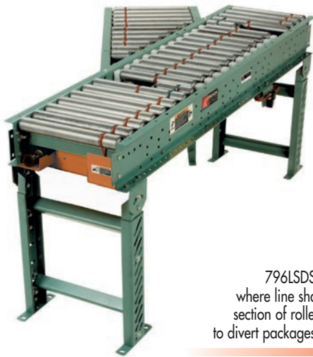
Conveyor shown with optional supports

796LSDS is used in diverging applications where line shaft conveyor is suitable. The pivot section of rollers, pneumatically actuated, skews to divert packages onto spur quickly and efficiently.