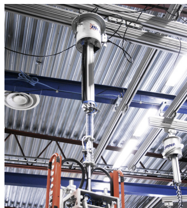
Free rotation offers great advantages in complex assembly operations.