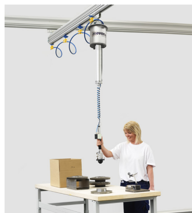
Mechlight Pro facilitates repetitive lifting.

1 + 2 + (3) : Mechlight Pro 50 specification