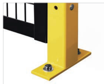
The sturdy 6" x 2" footplate makes the system extremely stable