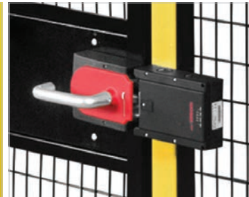
Safety Switch (Multiple Options Available)