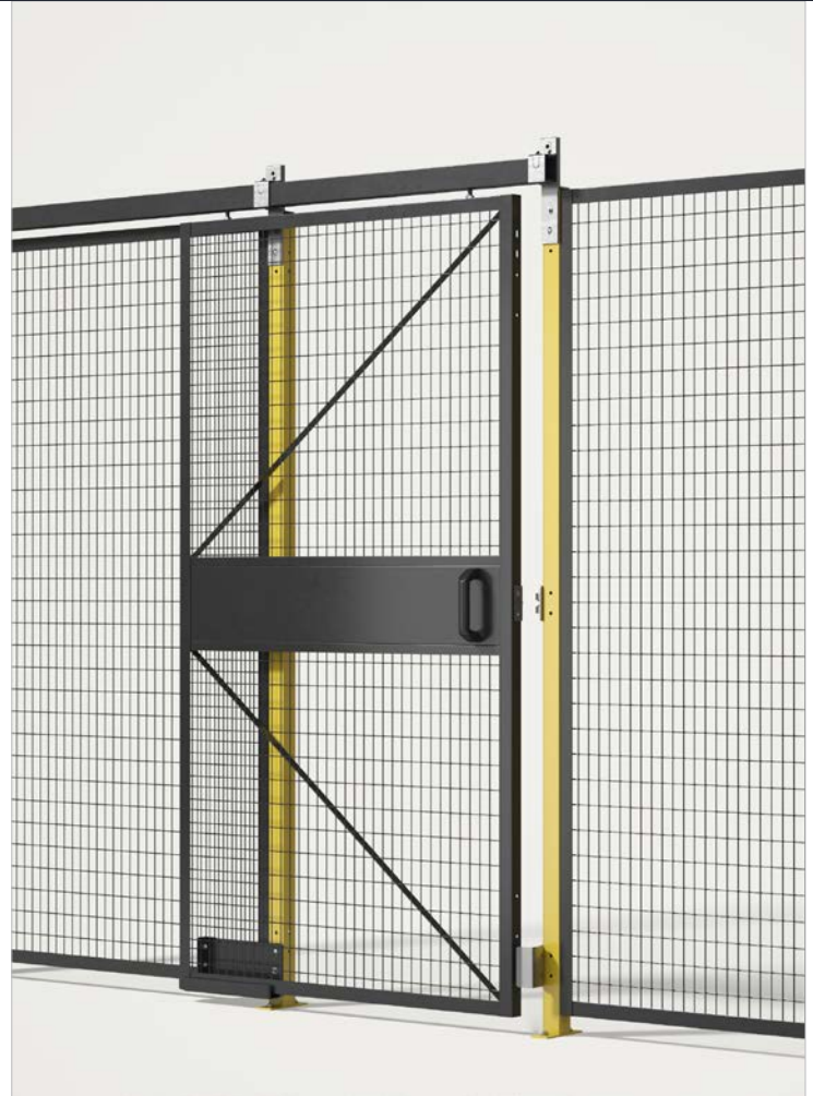
Slide door with snap lock

Our modular system consists of three system heights, multiple styles of doors and over 30 pre-fabricated wire mesh panel sizes. All pieces assemble and install precisely and easily. You'll enjoy worker safety, less downtime and compliance with federal safety regulations when you use Saf-T-Fence® to fulfill all of your machine guarding needs.