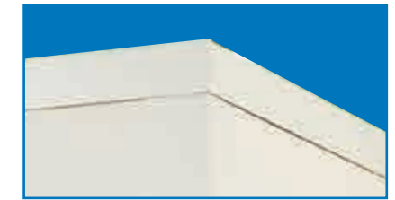
Pre-cut and mitered components for a tight, clean fit

"The design of the doors on our modular office is typical of Starrco's commitment to innovation. By mounting the door frame within the wire stud, they achieve an aesthetically pleasing look and, more importantly, a door that always opens and closes smoothly."