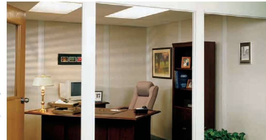
Full View Tempered Safety Glass