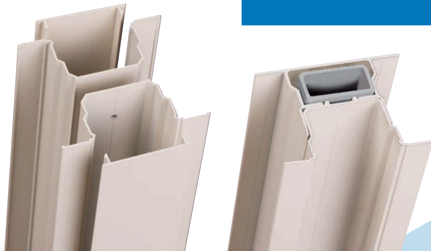
Track and posts are available with a khaki baked on painted finish.