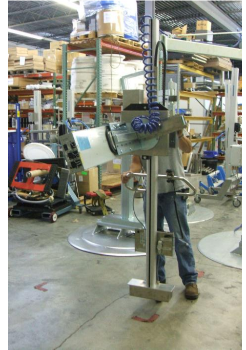
Rotated Vacuum Attachment