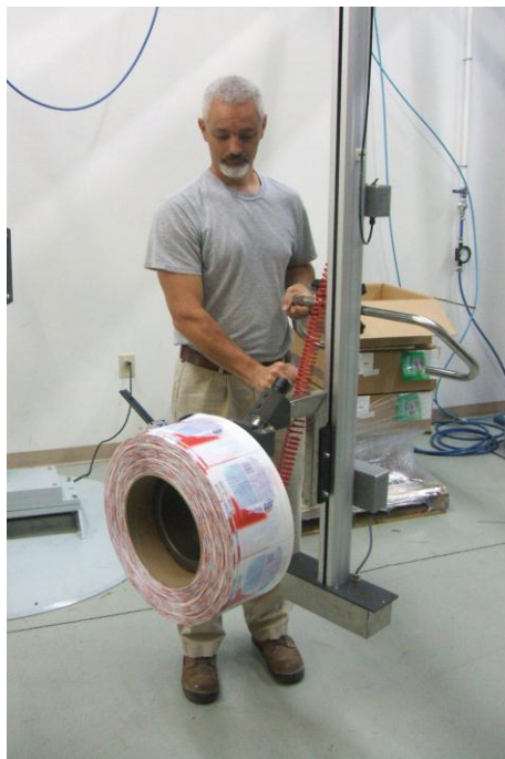
Expand-O-Turn® Air Actuated w/Anti-Telescopic Device-Manual Rotate Roll Handling