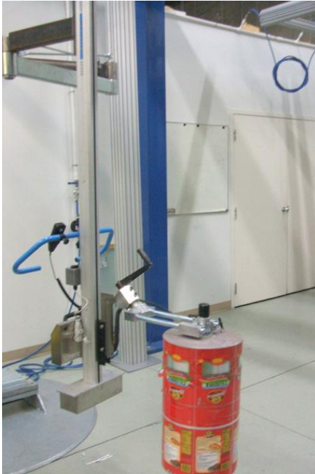
Expand-O-Turn® Electric Expand/Retract Manual Rotate Roll Handling