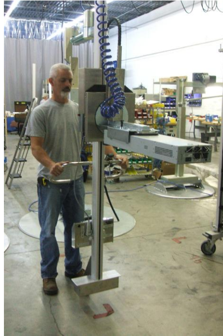
Vacuum Attachment Electric Rotator Plant Air for Vacuum Electronic Handling