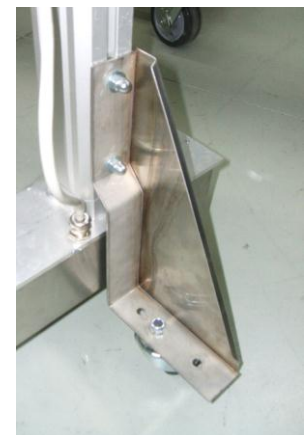
Optional: Stabilizer Castor