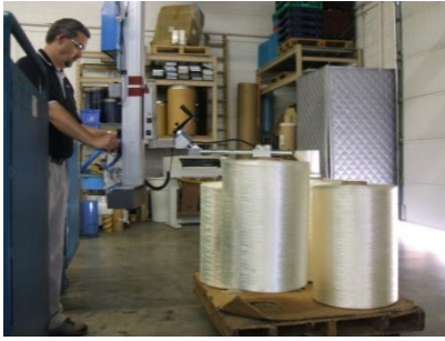
Roll Handling-Expand-O-Turn® Core Vertical to Cores Horizontal