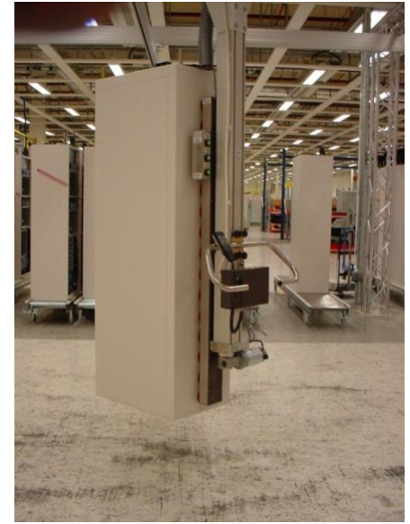
Electronic Cabinet Handling Vacuum