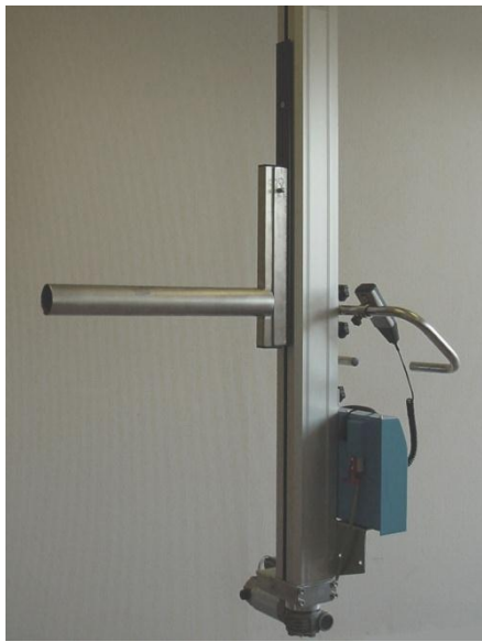
Core Probe Horizontal to Horizontal Roll Handling