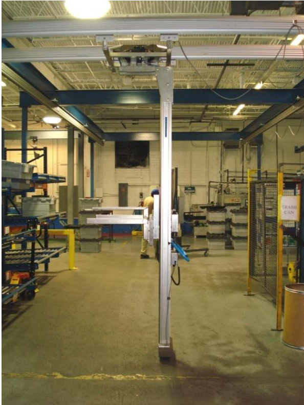
Clear Floor-No Obstructions