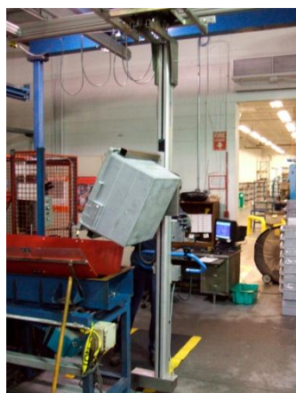
Tote Dumping into Hopper

The Lift-N-Glide™ is a marriage between two systems the MovoMech® Rail System and the Lift-O-Flex® Ergonomic Lifter w/End-effectors. This marriage offers diverse load handling characteristics for mid-weight and heavy-weight load capacities. The Lift-N-Glide™ has a lift capacity of up to 500-lbs. and offers RonI expanded flexibility in equipment selection to better fill your ergonomic lifting requirements.