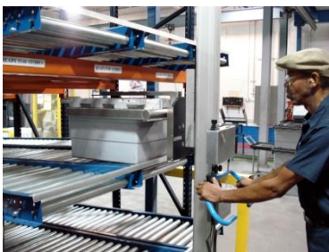
Flow Rack and Pallet Interface