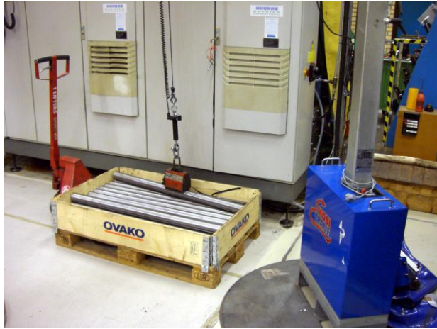
Magnetic Bar Stock Lifting