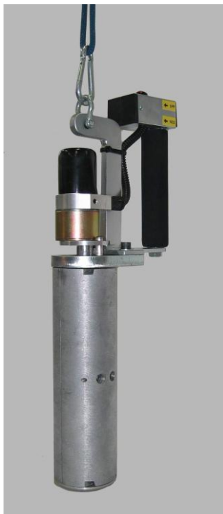
Roll Handling Electric Expander

THOMAS CONVEYOR and Equipment Company, Inc.