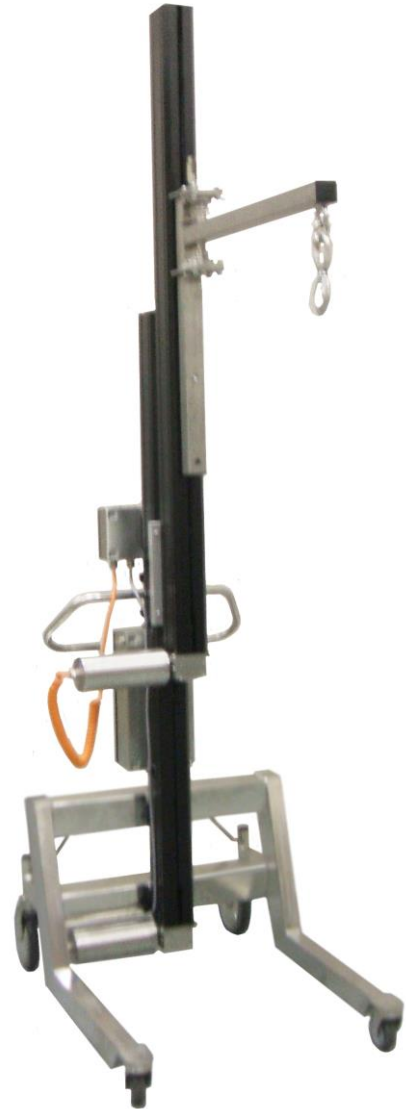
Telescopic Mast Swivel Arm with Lifting Hook