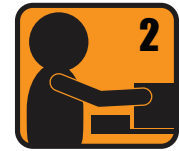
Reach Factor 2 Some Reach-Over