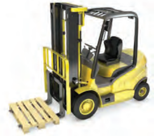
No fork lift required.