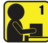
Reach Factor 1 Minimal Reach-Over