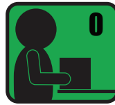
Reach Factor 0 No Reach-Over

The products in this brochure provide workers with improved access to palletized goods. Check the Reach Factor Icon associated with each product to determine the level of access it provides.