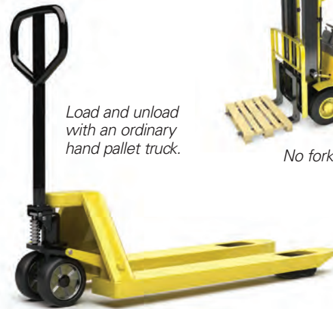
Load and unload with an ordinary hand pallet truck.

Then there's the waiting factor. Chances are you have many more hand pallet trucks than fork lifts. Rather than waiting around for a forklift and trained operator to load or unload a device, your employee can just grab a hand pallet truck and do it on their own.