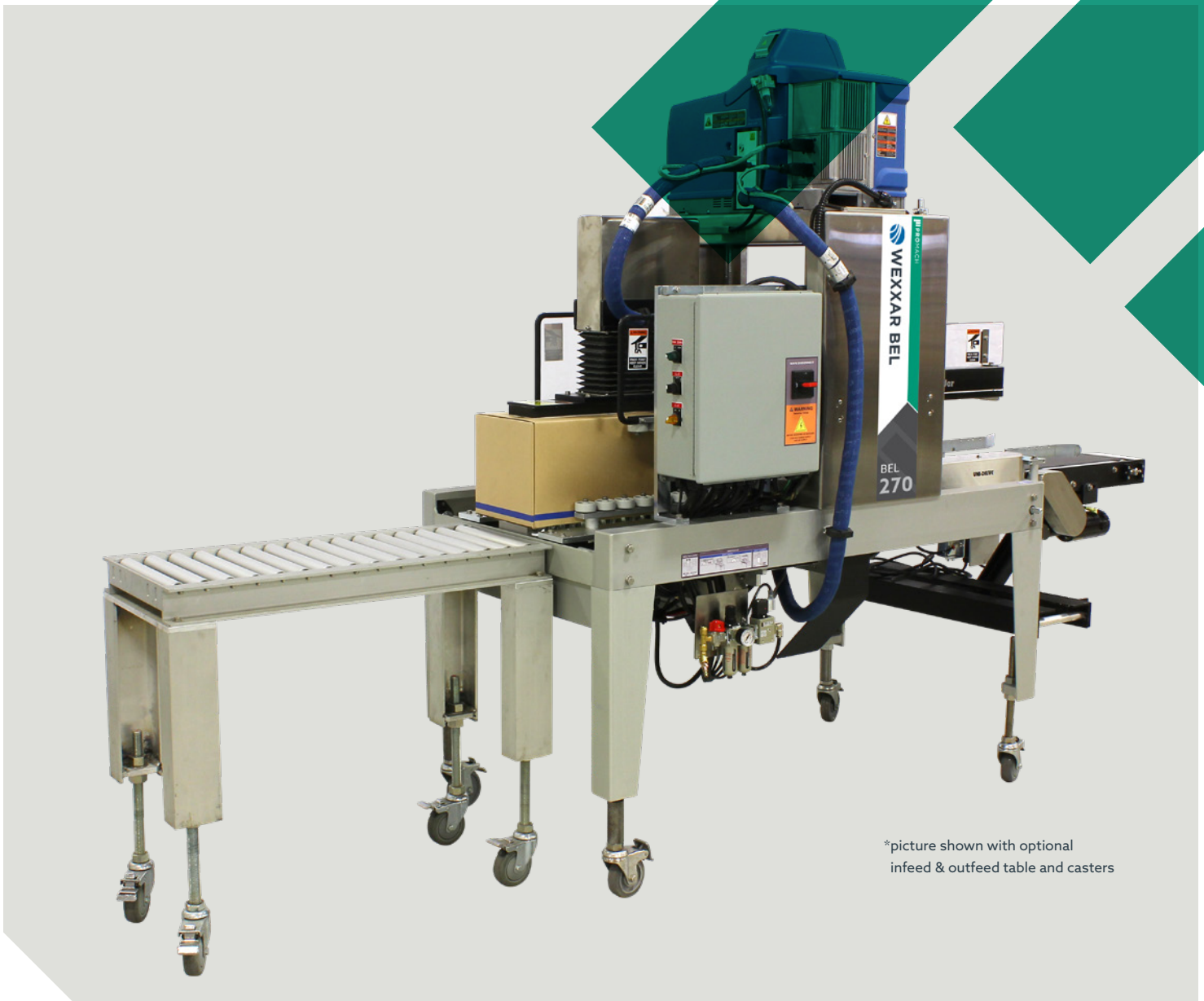
*picture shown with optional infeed & outfeed table and casters