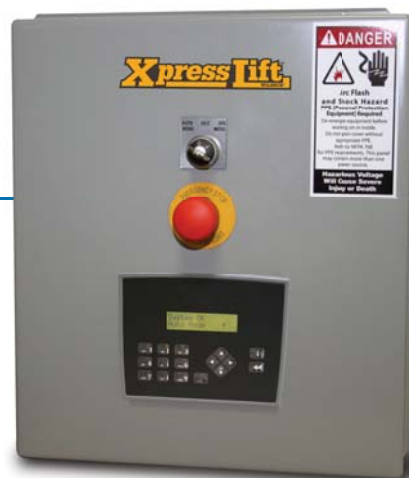
“All-In-One” Controller with Intuitive Text Display